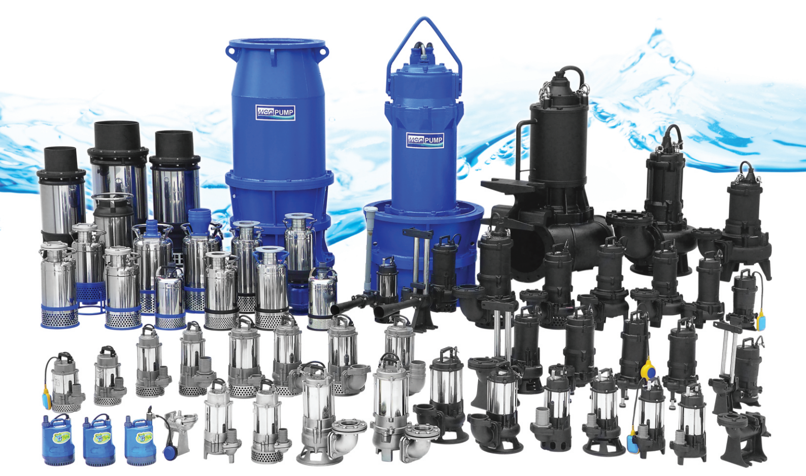
sewage pump, waste water pump, stainless pump, grinder pump, dewatering pump, contruction drainage pump, large volume pump, axial pump, ejector, deep well pump.